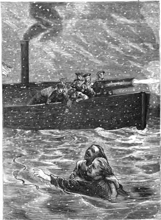
A Swim for Life.—Page 277.